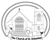
THE CHURCH OF ST. SEBASTIAN PROVIDENCE, RI